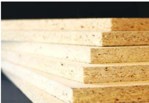
Figure 1 Picture of particle board P2.

Product identification and description: Particle board P1 is a general-purpose board used for dry conditions indoors. The standard particle board, P2, and Elittaket/Elitväggen, are used for building and furniture and can be used for walls, ceilings and as packaging material. Byggelit's particle board P4 is used indoors. Byggelit's particle board P6, also called Contifloor, is used for floors and can for example be used as an underflooring.