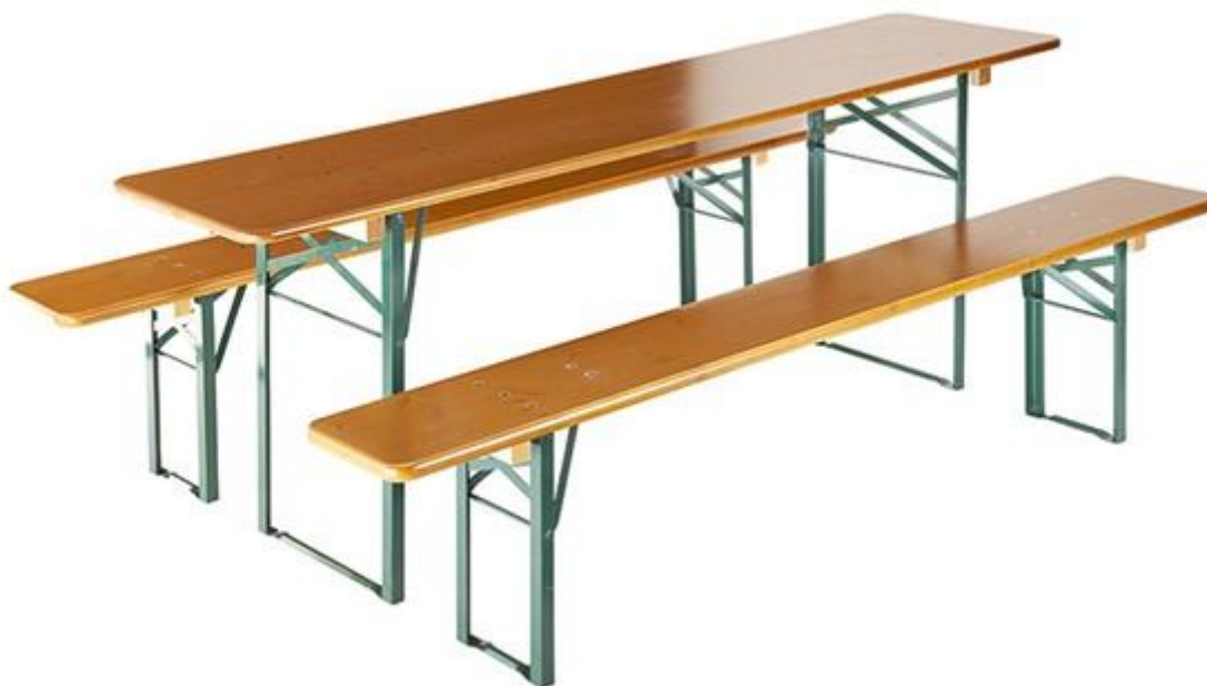
Figure 1. Edge-glued wood panels in use

This study assesses the environmental impacts of edge-glued wood panels, both natural and with finishing. The panels offer versatile applications, including furniture construction, renovation, interior design, and structural use in buildings. They feature a decorative finish and are ready for direct installation on ceilings or walls. Figure 1 illustrates the usages of the products.