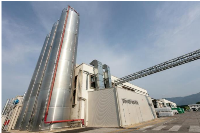
Figure 2: Manifattura Fontana S.p.A Production plant – Romano d'Ezzelino (VI)