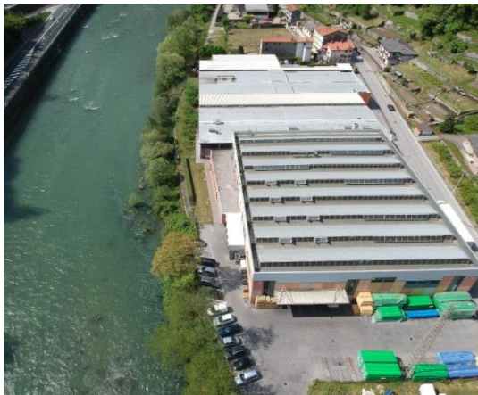
Figure 1: Manifattura Fontana S.p.A Production plant – Valbrenta (VI)

Manifattura Fontana was born in 1932, starting with the transformation of cotton fibers for technical and sanitary uses. Since 1963 Manifattura Fontana has been a leading player in the market of nonwoven fabrics and geotextiles. Since 2016 Manifattura Fontana has become partner of Sioen group, a leader in the production of yarns, technical fabrics and protective clothing. Manifattura Fontana is a leader in geotextiles market thanks to an accurate raw material choice and a continuous search for new solutions for product development, combining its experience with the solidity of a consolidated multinational group.