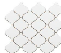
FLAME WHITE GLOSS