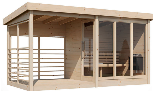
ANITA T with terrace